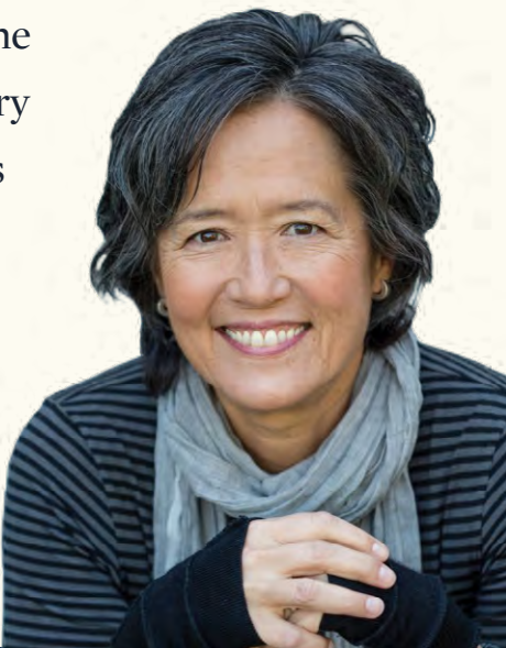
Ruth Ozeki, Author

Ruth, a writer, finds a Hello Kitty lunchbox washed up on a beach. Tucked inside is the diary of a Japanese girl named Nao. Once Ruth begins to read the diary, she quickly finds herself drawn into the mystery of Nao's fate. Meanwhile in Tokyo, Nao has decided there's only one escape from her aching loneliness and her classmates' bullying. But before she ends it all, Nao plans to document the life of a Buddhist nun in the pages of her secret diary.