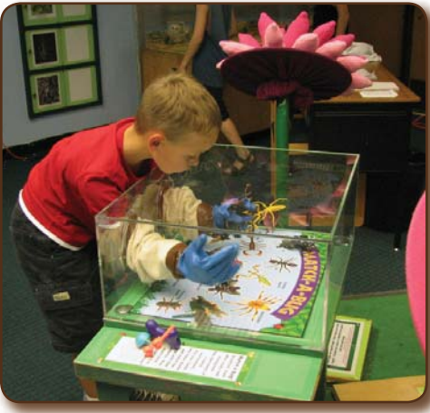
Nearly 13,000 children explored and learned in the Bugology! Discovery Room funded by Comcast through the Salem Public Library Foundation.

Salem Public Library Foundation P.O. Box 14810 Salem, Oregon 97309